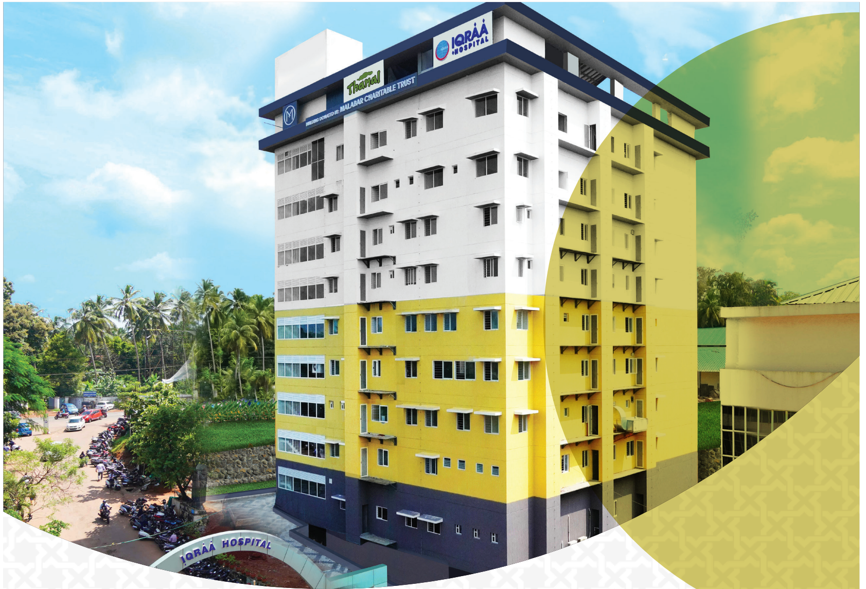
IQRAA KIDNEY CARE & RESEARCH CENTRE